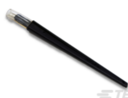
TE Part # 843477-1 TOOL, EXTRACTION RESET