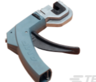
TE Part # 58336-1 HEAD (IDC) MODU MTE W/O TL